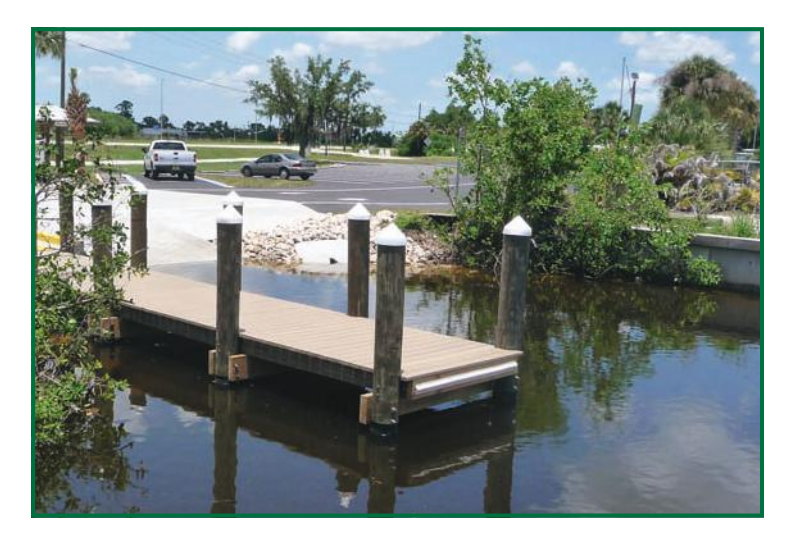
El Jobean boat ramp and parking renovations were completed, including construction of a new ramp, loading dock and paved parking.