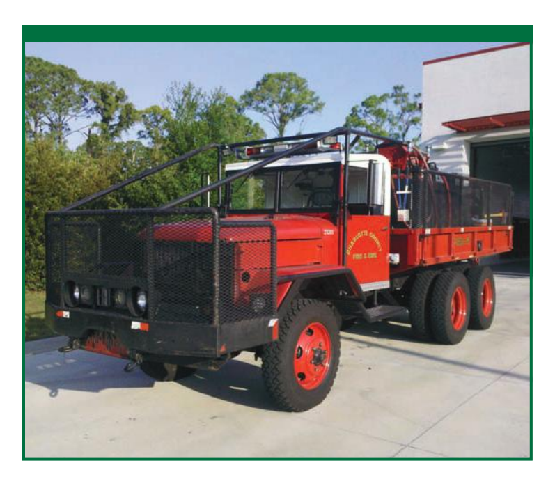
The Brush 15 Truck and has three drive axles, making it a 6 x 6.

The final balance of the 19 million from the 2005 Hurricane Housing Recovery (HHR) grant funding was released to the last planned housing development complex. Charlotte Crossing will provide 82 affordable apartments for seniors. The balance of the remaining unallocated HHR funding was awarded to Habitat to Humanity to rehabilitate housing for eligible households. The HHR grant is scheduled to close out June 30, 2011.