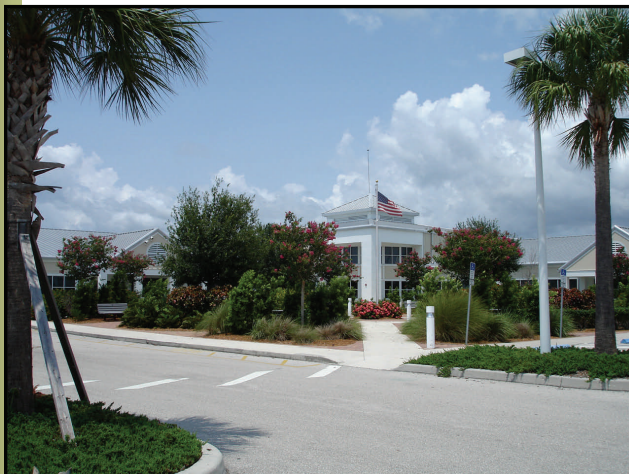
Distributed by Charlotte County Government.