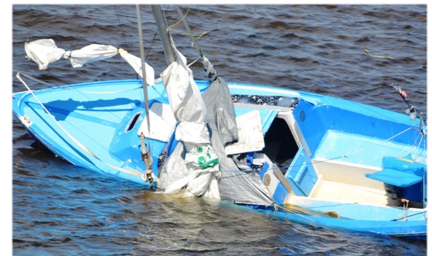
Abandoned sailboat in Charlotte Harbor

Click on 82050 form. Both the Seller and Buyer must sign the form. The seller must then submit the form to the Local Tax Collector's Office and keep a copy for your records.