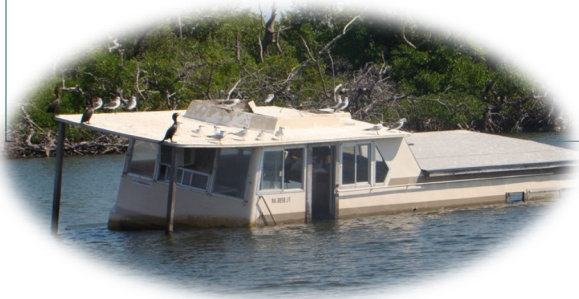
Sunken Houseboat behind Cayo Pelau

West Coast Inland Navigational District (941) 485-9402