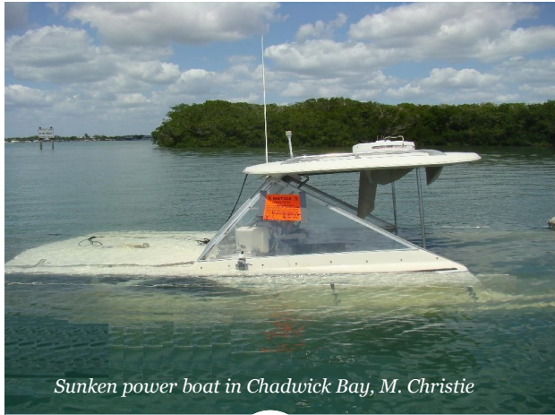
Sunken power boat in Chadwick Bay, M. Christie