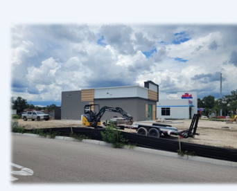
Dunkin' Donuts 19220 Veterans Blvd., Port Charlotte 1,731 sq. ft. Dunkin' Donuts with a drive-thru.