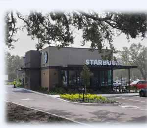
Elegance Plaza 14520 Chancellor Blvd.. Port Charlotte 1-story 15,300 square foot shopping plaza.