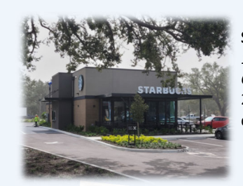
Starbucks 18501 Murdock Circle, Port Charlotte 2,500 sq. ft. Starbucks with double drive-thru lanes.