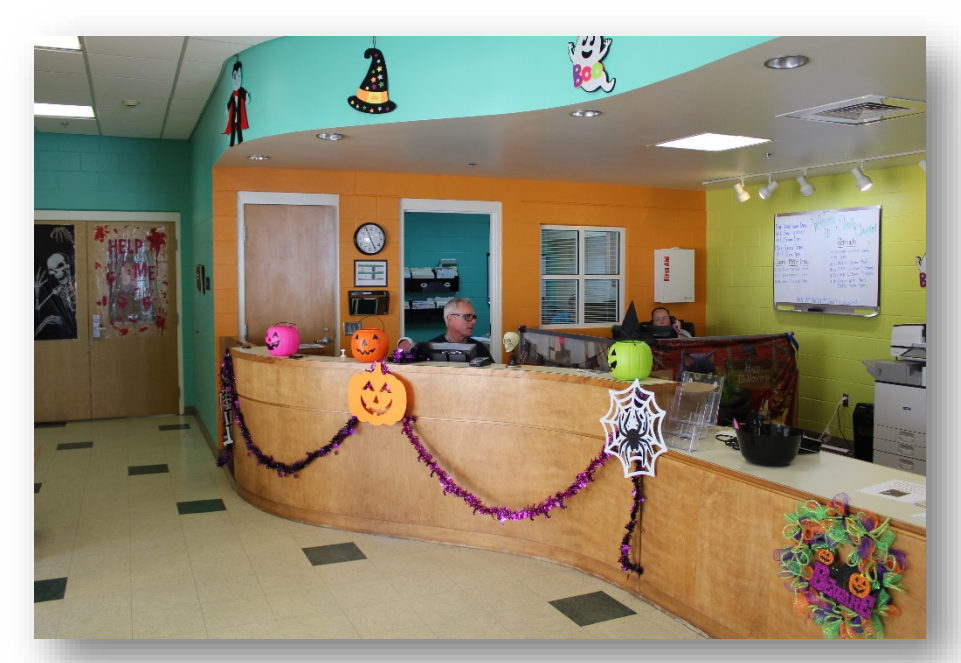
Harold Ave, and South County